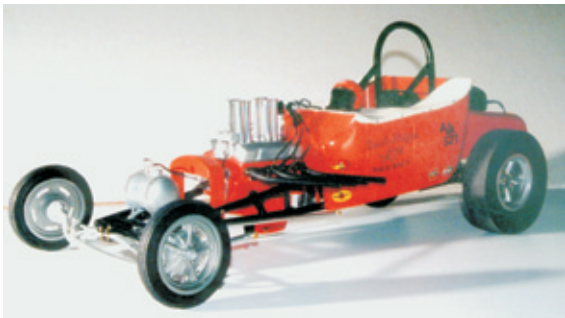
Debbie Desch's fuel altered.