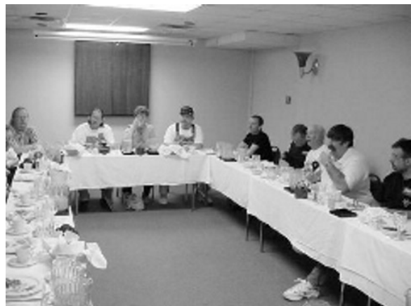
A bunch of GSL-XVIII attendees enjoy breakfast with the Pyes on Friday morning.

During GSL, we also received a 1956 Ford Pickup, red with gold flames, from an unknown modeler. If anyone knows who donated this model, please contact us.