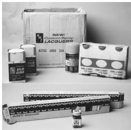
A few of the vintage paints donated to the Museum by Don Emmons.

As in the few past years, the car modeling hobby in Finland is still gathered under a common organization: Finnish Car Modelers Association (FCMA). The number of members has reached a steady level (about 150 nationwide) and so have the basic activities. The main happening is the annual show, one of the major four mentioned above. The news in last year's show was the giveaway package, handed out to each competing entrant. It included a special FCMA 2000 license plate, along with a photoetched frame. While many top Finnish modelers have been using photoetched aftermarket accessories for years, it is likely that this gift from the Model Car Garage and Rik Hoving (who did the license plate artwork) was the first opportunity for several juniors to actually see a photoetched accessory. Most likely this will be an easy and fruitful introduction to the world of aftermarket accessories. FCMA would like express their gratitude to both Bob Korunow of MCG and Rik Hoving!